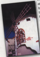
Don Quixote's windmill