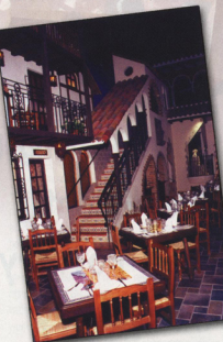
Inside Don Quixote restaurant